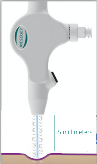
5 millimeters from skin surface targets the optimal penetration

The use of the Franz diffusion cell method for the evaluation of percutaneous absorption of substances in order to predict their behavior in vivo is consolidated and supported by a large literature in cases where the stratum corneum is the main barrier that limits dermal and transdermal absorption. The test performance methods are reported in the "GUIDANCE DOCUMENT FOR THE CONDUCT OF SKIN ABSORPTION STUDIES, OECD SERIES ON TESTING AND ASSESSMENT, Number 28" (2, 3). As regards the choice of the diffusion membrane, pig skin is indicated in the literature as the most appropriate alternative to human skin for predicting absorption in vivo. The exposure time was set at 5 hours.