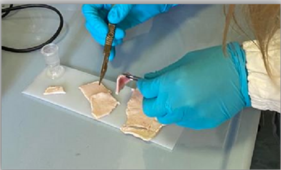
skin of animal origin (pig) obtained from ear as a membrane

UB-CARE Srl, Via Riviera, 39 - 27100 Pavia (PV) - Italy – UNIVERSITY OF PAVIA. Report nr. TCP/22/JT1P1.1. Date: 11/05/2022. The full version of this study is available upon request.